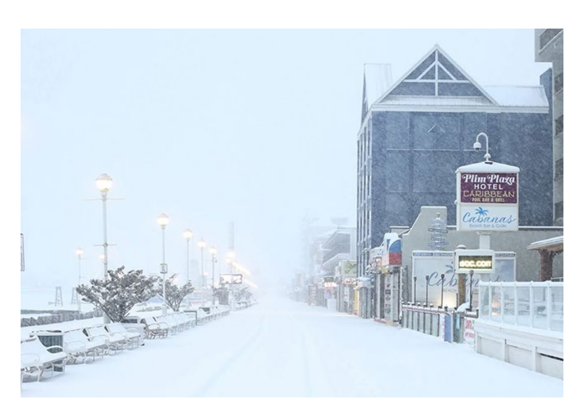
"See Yourself Here"